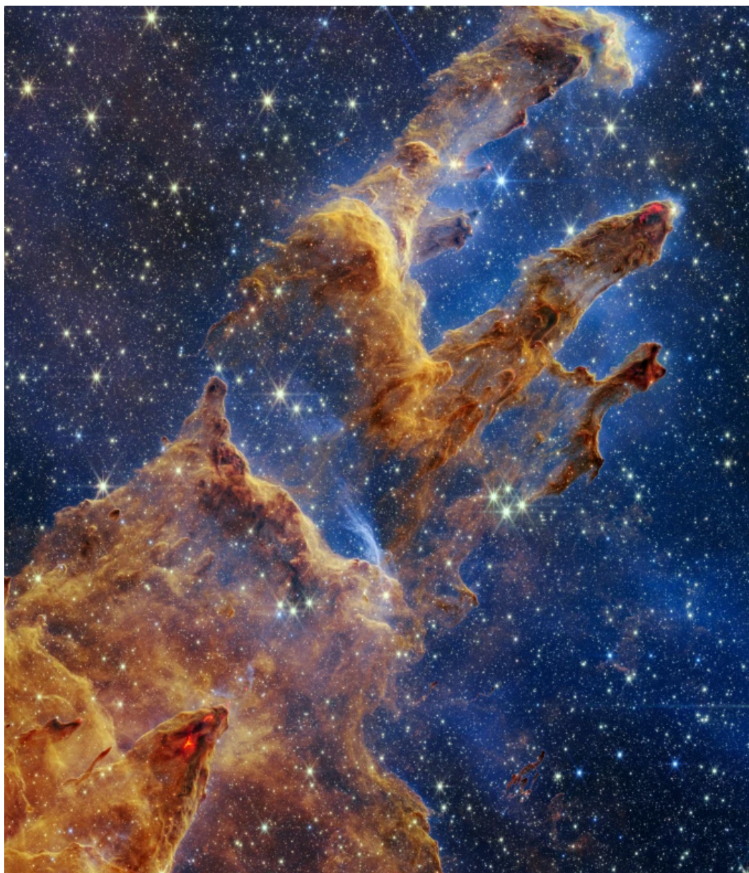
Pillars of Creation, James Webb Telescope, 2022

HOMECOMING SEPTEMBER 10, 2023 • 11:00 AM