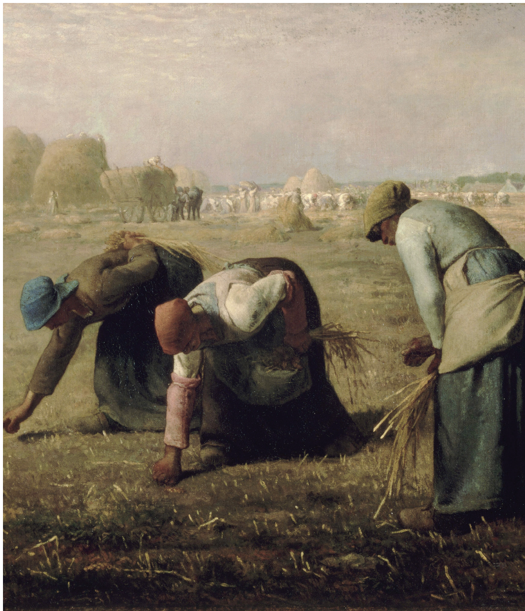
Jean-François Millet, The Gleaners , 1857