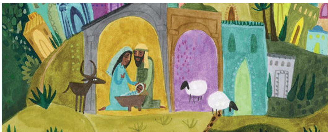
Kate Cosgrove, Nativity Three , 2014