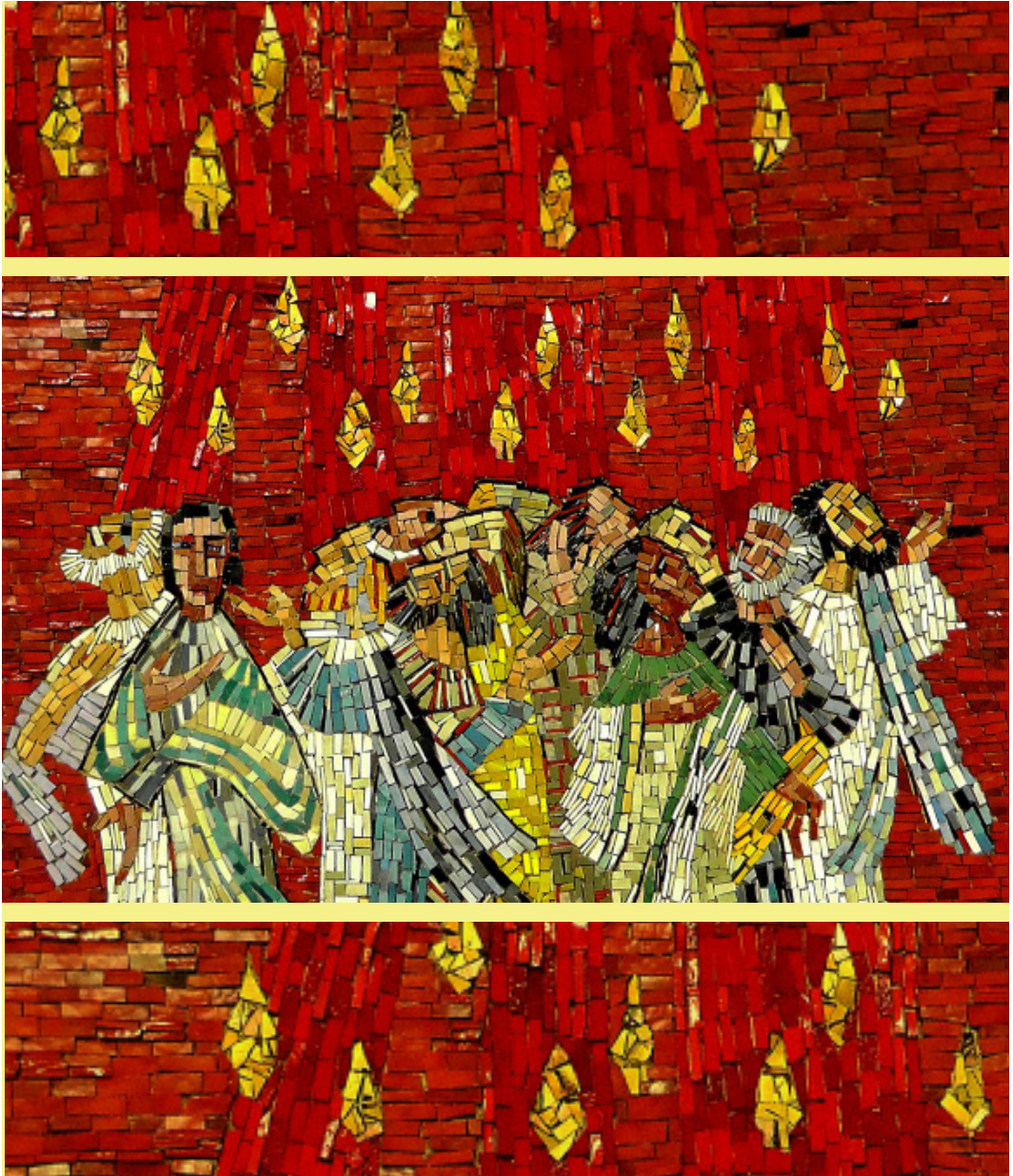
Mosaic. Photograph by Holger Schué, 2014.

DAY OF PENTECOST MAY 19, 2024 • 11:00 AM