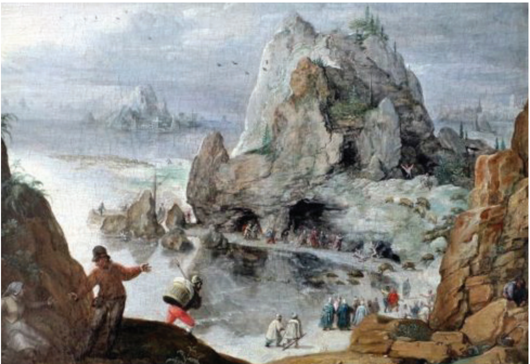
Lucas Van Valckenborch, Exorcism of the Gerasene Demoniac

FIFTH SUNDAY AFTER PENTECOST JUNE 23, 2024 • 10:00 AM