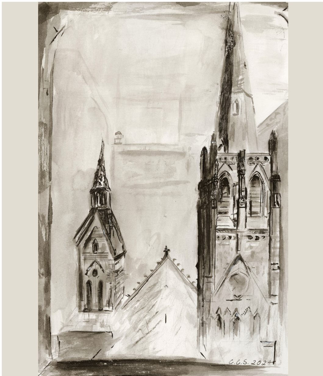
Chad Schepp, View from the Living Room , 2024