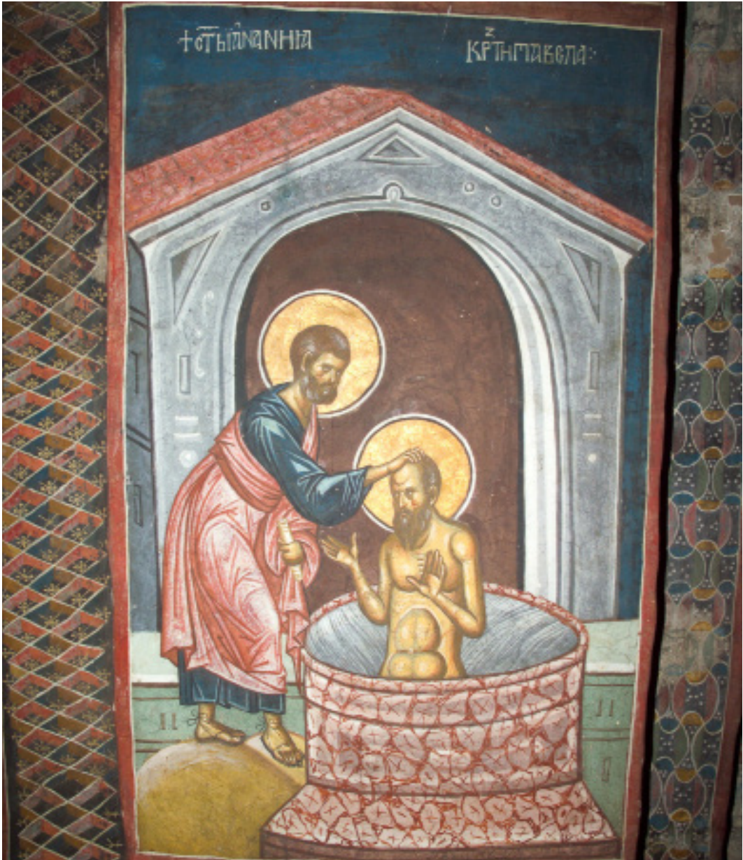
Fresco from the Visoki Dečani Monastery, Ananias Baptizes Paul

THIRTEENTH SUNDAY AFTER PENTECOST AUGUST 18, 2024 • 10:00 AM