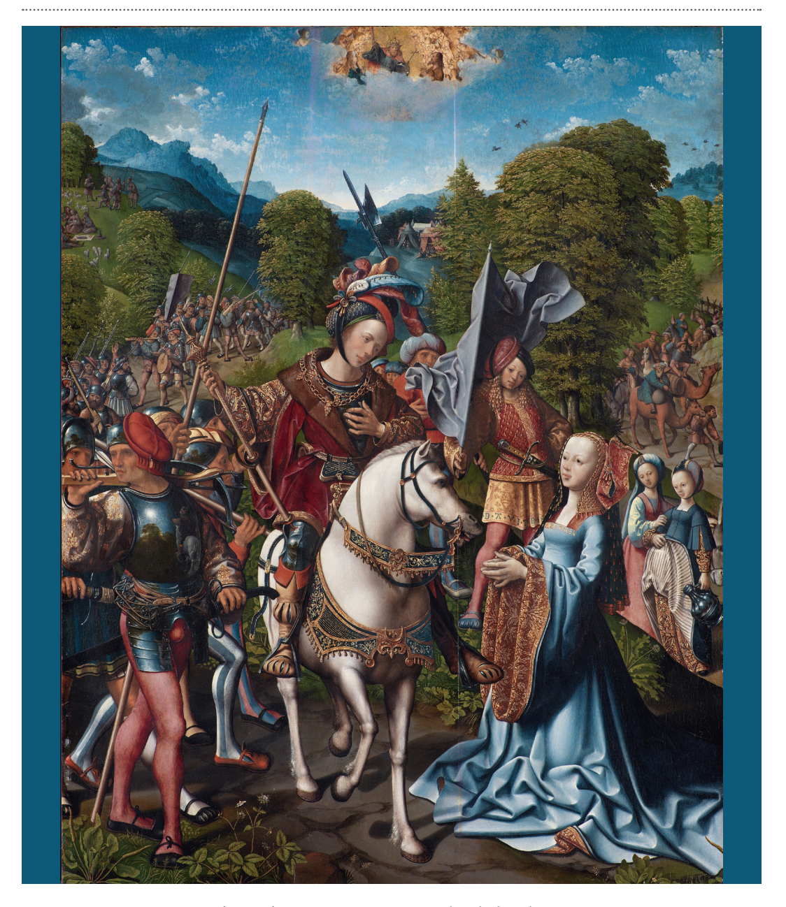
Jacob Conelisz van Oostsanen, David and Abigail, c. 1500

TWENTY-FIFTH SUNDAY AFTER PENTECOST NOVEMBER 10, 2024 • 11:00 AM