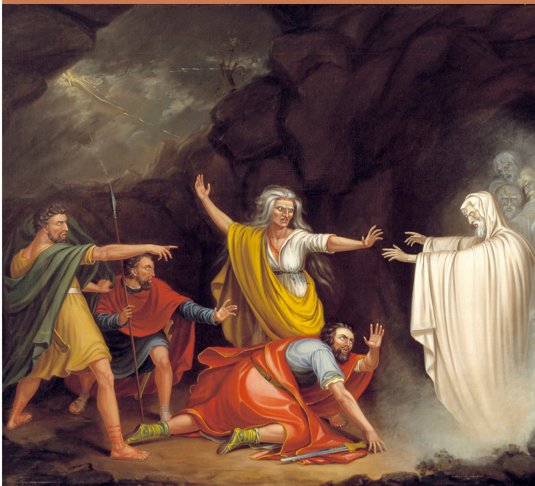
William Sidney Mount, Saul and the Witch of Endor , 1828

TWENTY-SIXTH SUNDAY AFTER PENTECOST NOVEMBER 17, 2024 • 11:00 AM