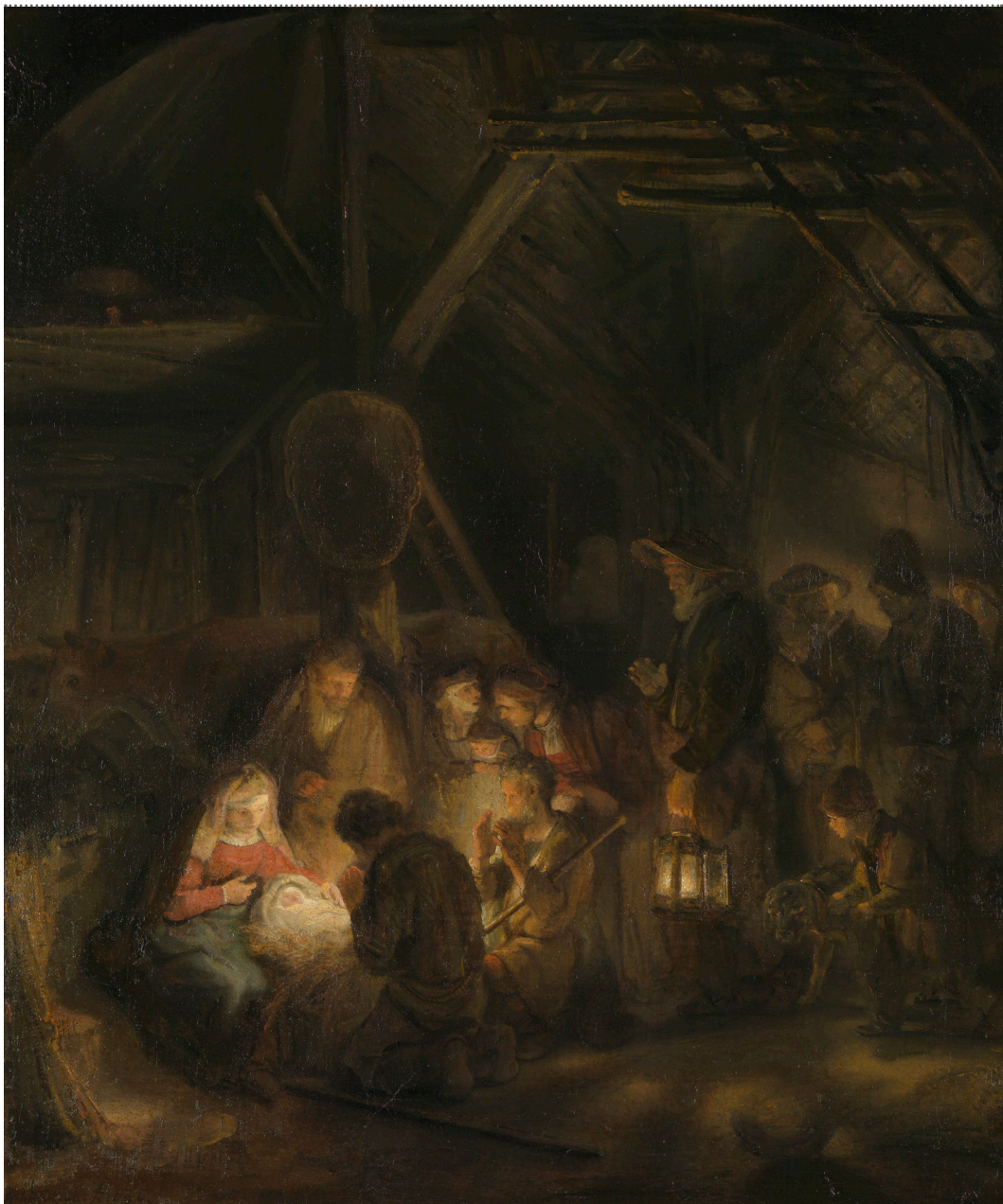
The Adoration of the Shepherds, Pupil of Rembrandt van Rijn, c. 1646.