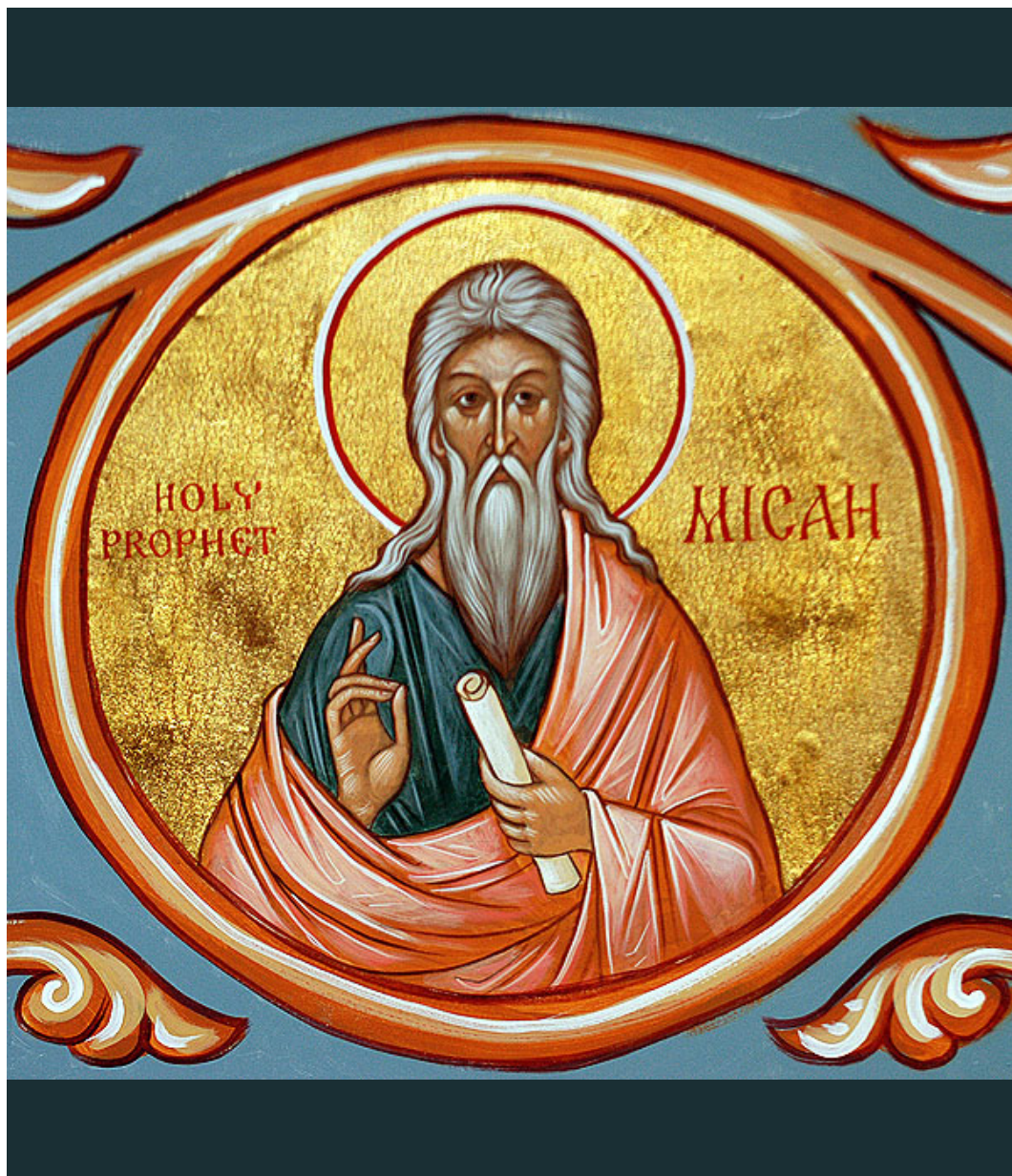
Icon of the prophet Micah