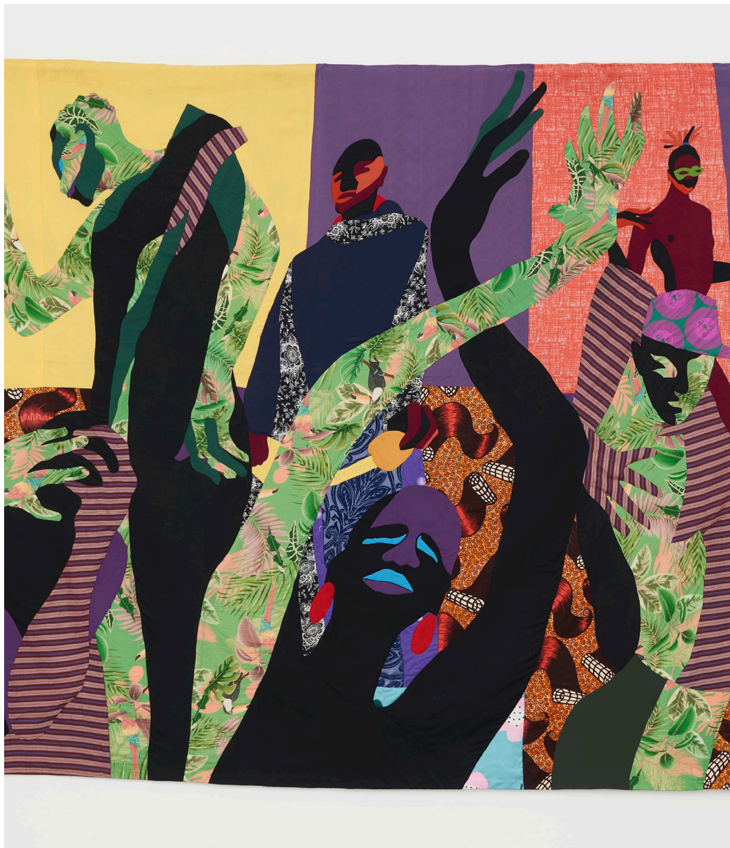
Christopher Myers, Nekiya (the stories of dead people make the map for us) , 2023