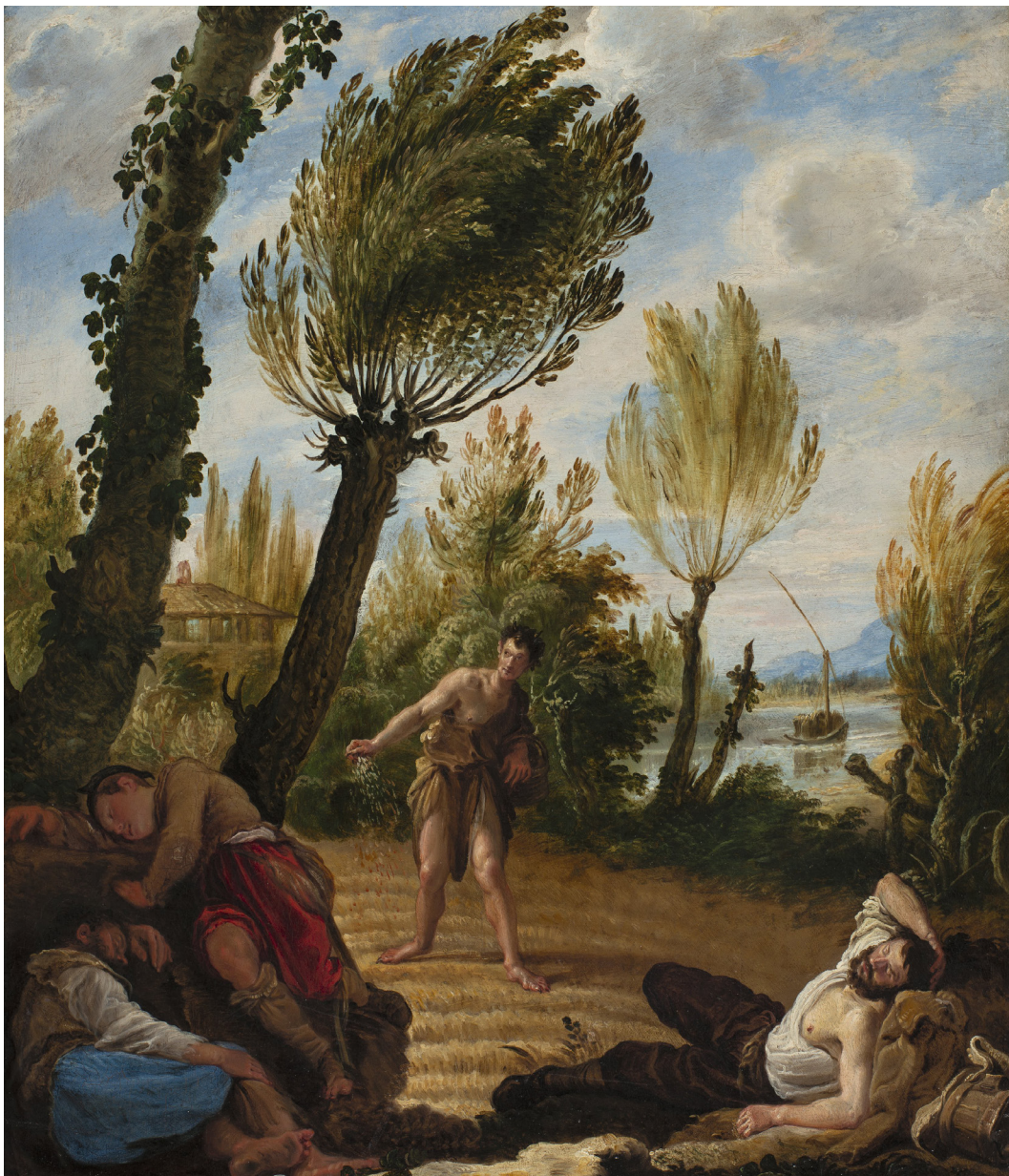
Domenico Fetti, The Parable of the Weeds , c. 1622

FIFTEENTH SUNDAY AFTER PENTECOST SEPTEMBER 21, 2025 • 11:00 AM