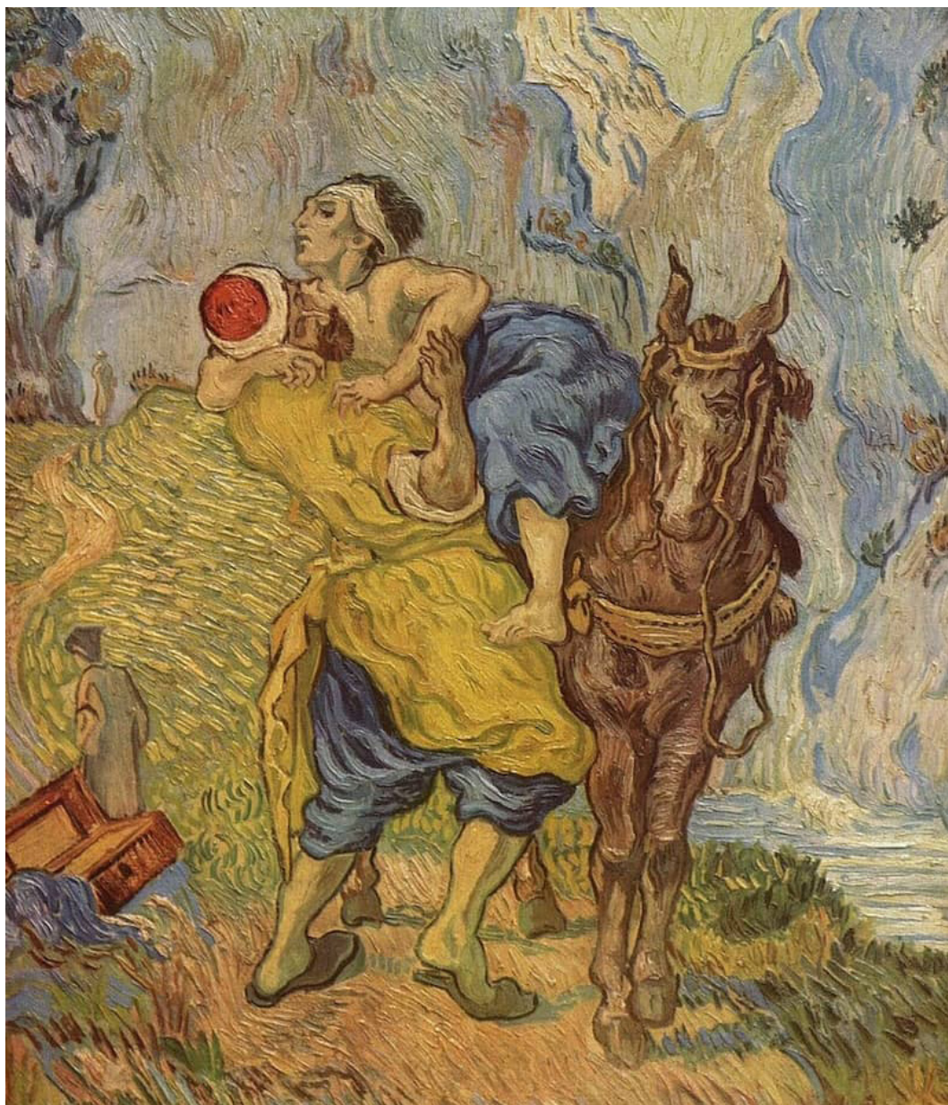
Vincent Van Gogh, The Good Samaritan , c. 1890

SIXTEENTH SUNDAY AFTER PENTECOST SEPTEMBER 28, 2025 • 11:00 AM