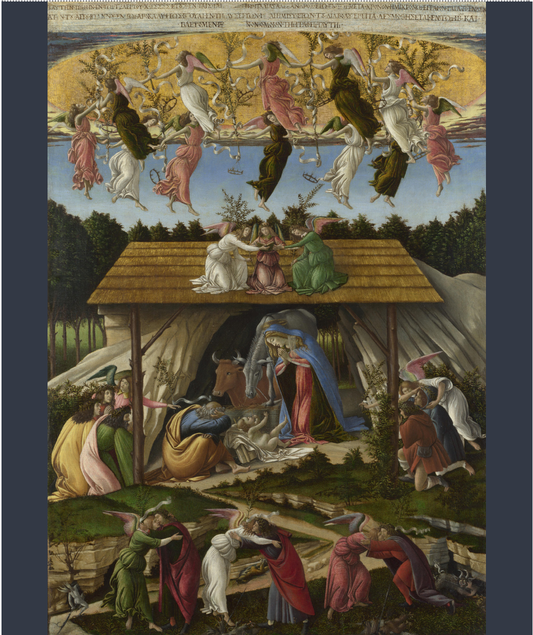
Sandro Botticelli, The Mystical Nativity , c. 1500