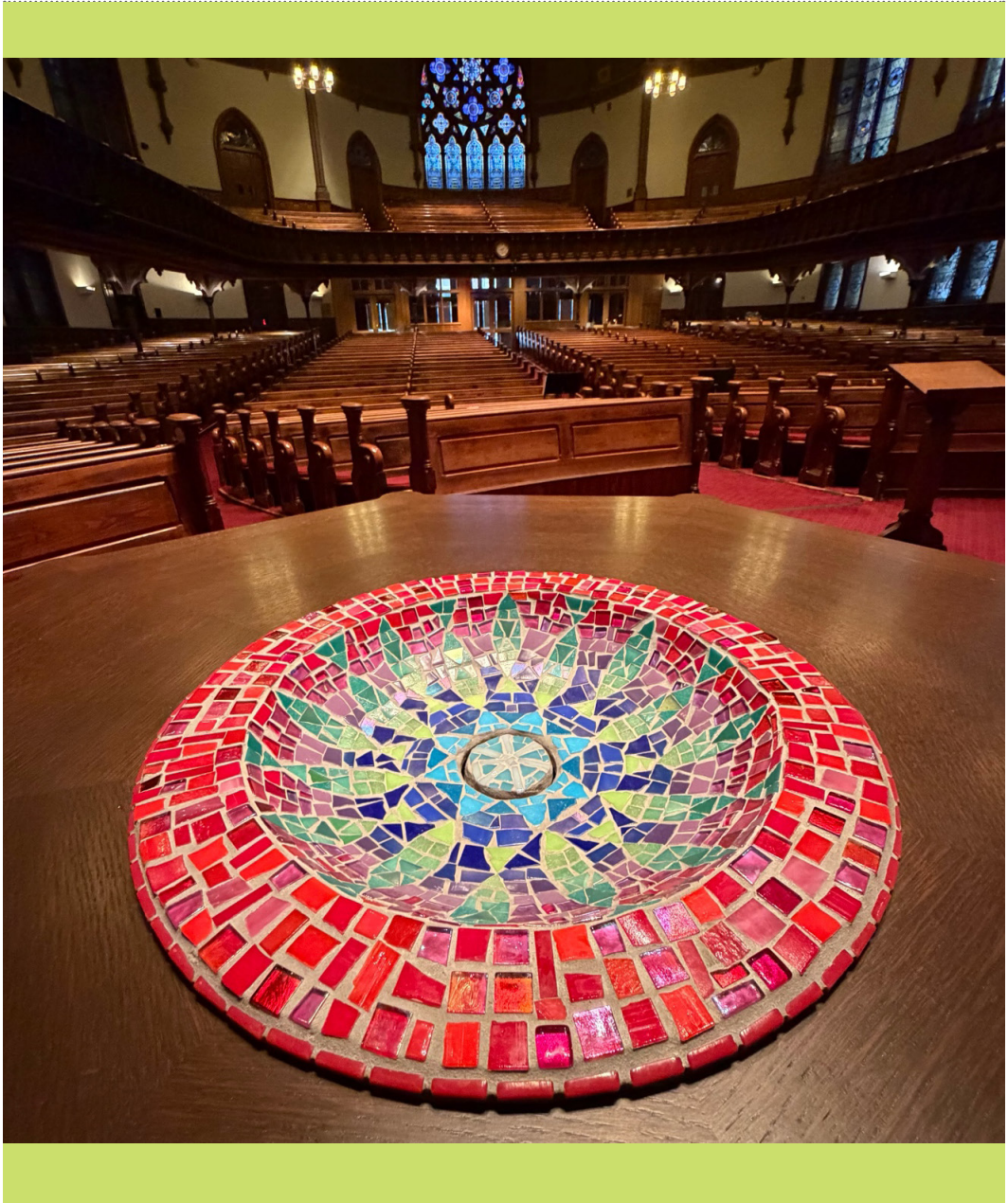
Erling Hope, Fifth Avenue Sanctuary Font , 2025

BAPTISM OF THE LORD JANUARY 11, 2026 • 11:00 AM