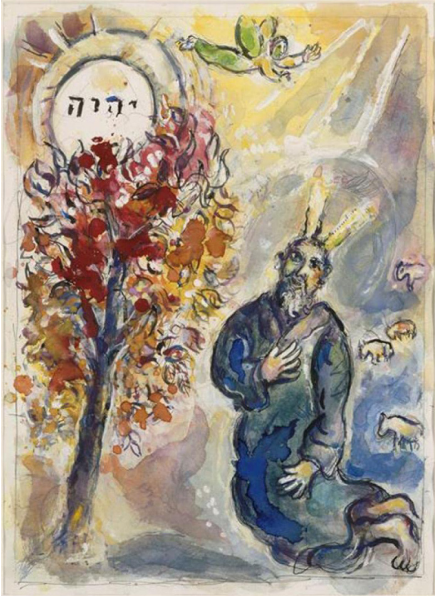
Marc Chagall, Moses and the Burning Bush , 1966

FIRST SUNDAY IN LENT FEBRUARY 22, 2026 • 11:00 AM