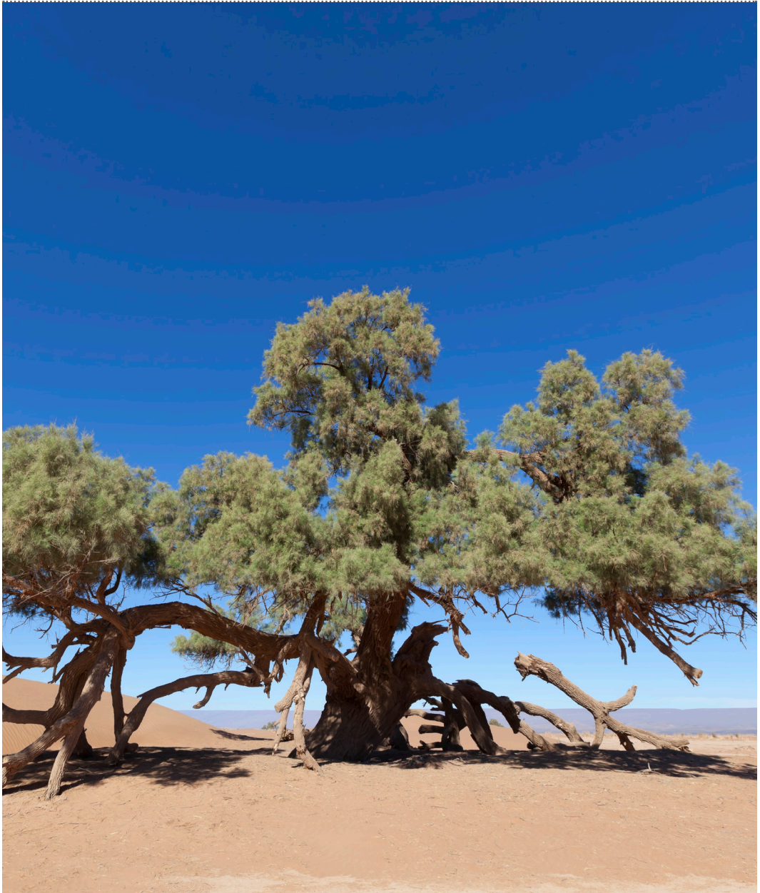
Rosa Frei, Tamarisk tree in the Sahara desert , 2013

SECOND SUNDAY IN LENT MARCH 1, 2026 • 11:00 AM