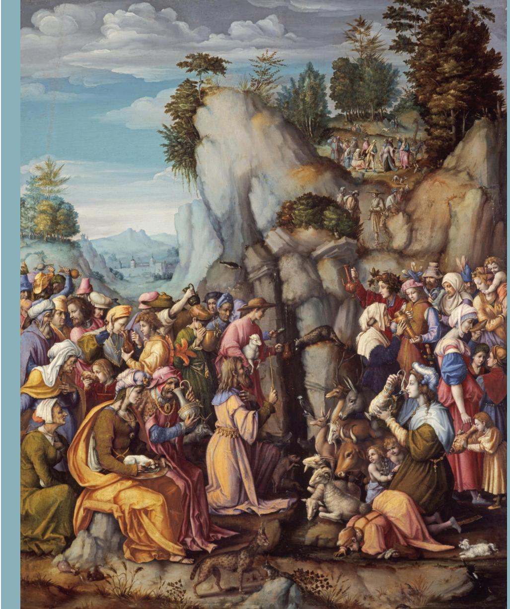
Francesco Ubertini, il Bacchiacca , Moses Striking the Rock , c. 1525

THIRD SUNDAY IN LENT MARCH 8, 2026 • 11:00 AM