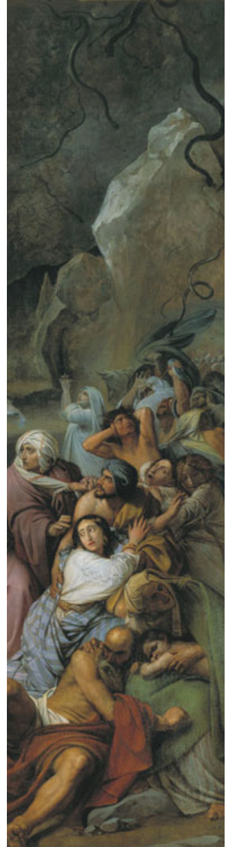
Fyodor Bruni, The Brazen Serpent , 1841