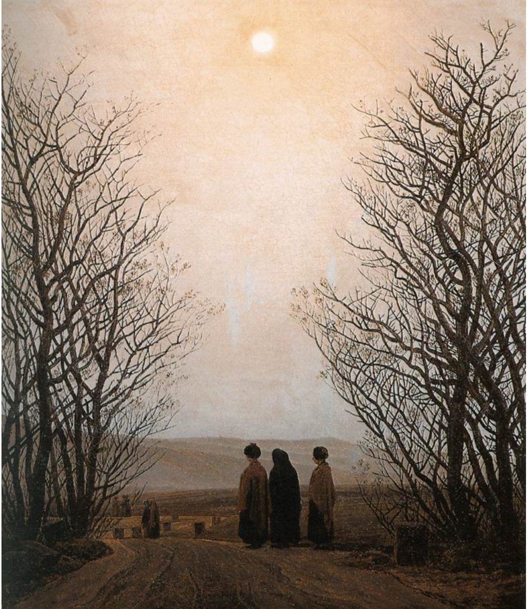
Caspar David Friedrich, Easter Morning , c. 1830.