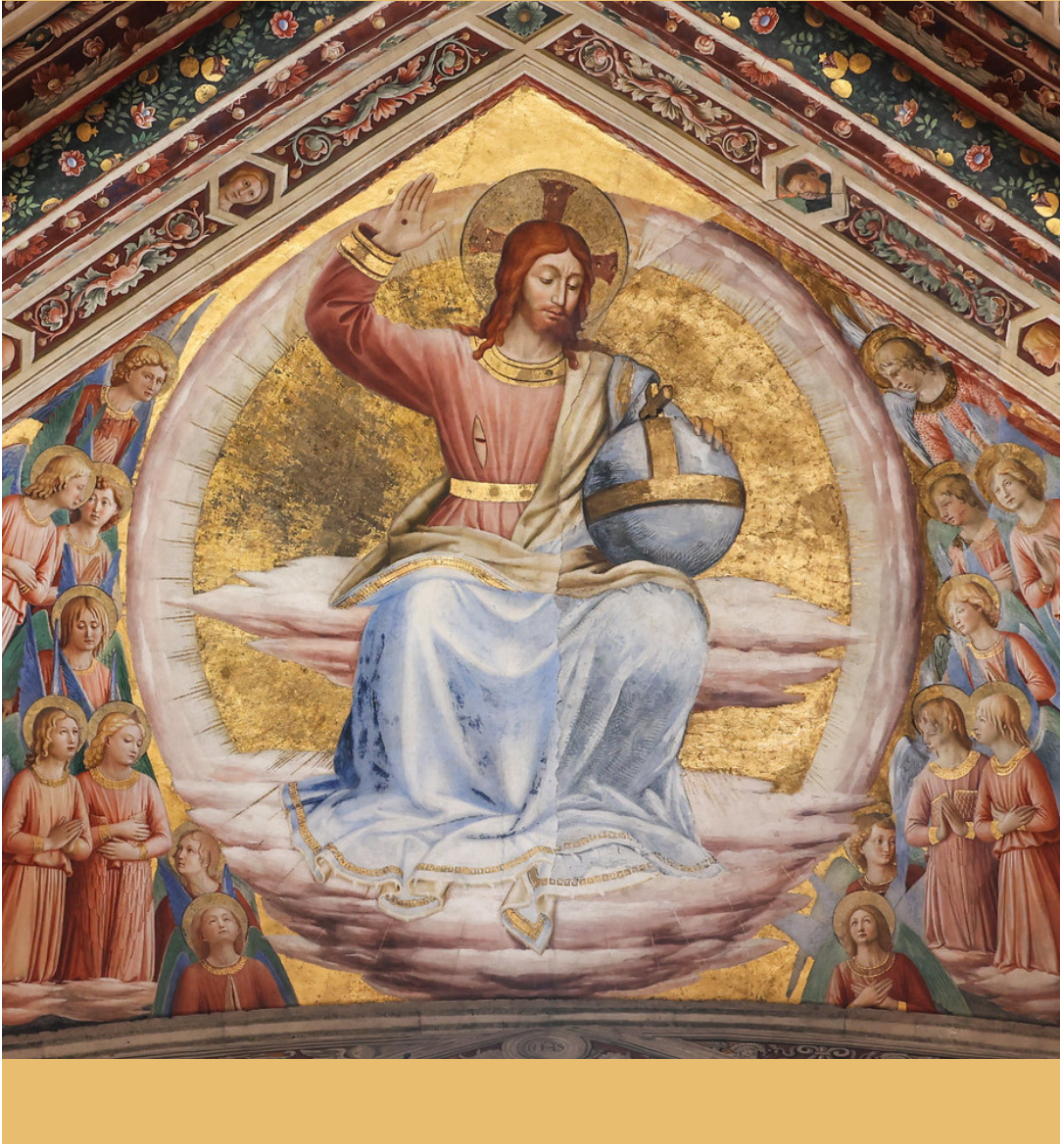
Fra Angelico, Christ the Judge , 1447

THIRD SUNDAY OF EASTER APRIL 19, 2026 • 11:00 AM