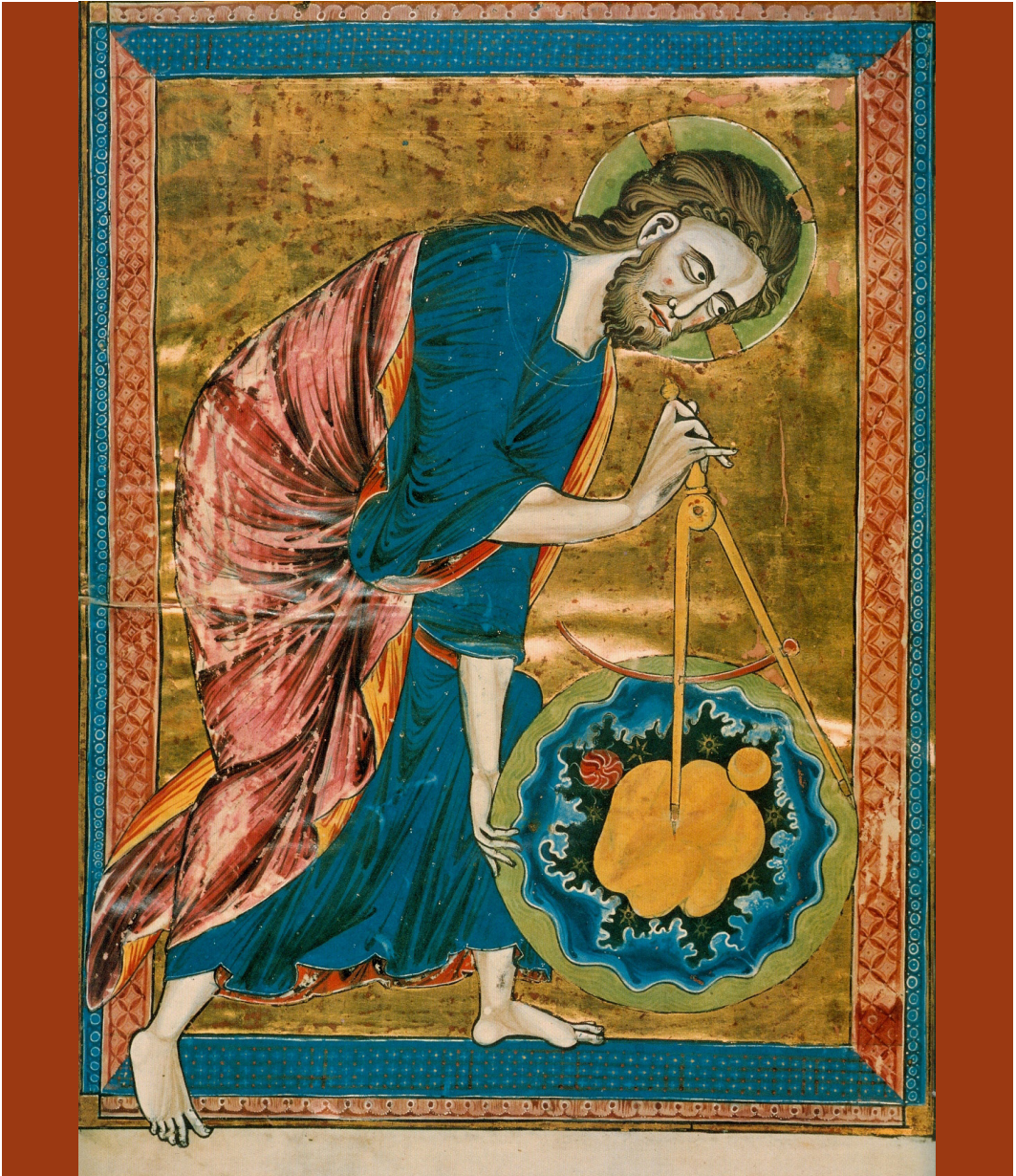
God the Architect Frontispiece of Bible Moralisée (Codex Vindobonensis) c. 1250 AD.

FIFTH SUNDAY OF EASTER MAY 3, 2026 • 11:00 AM