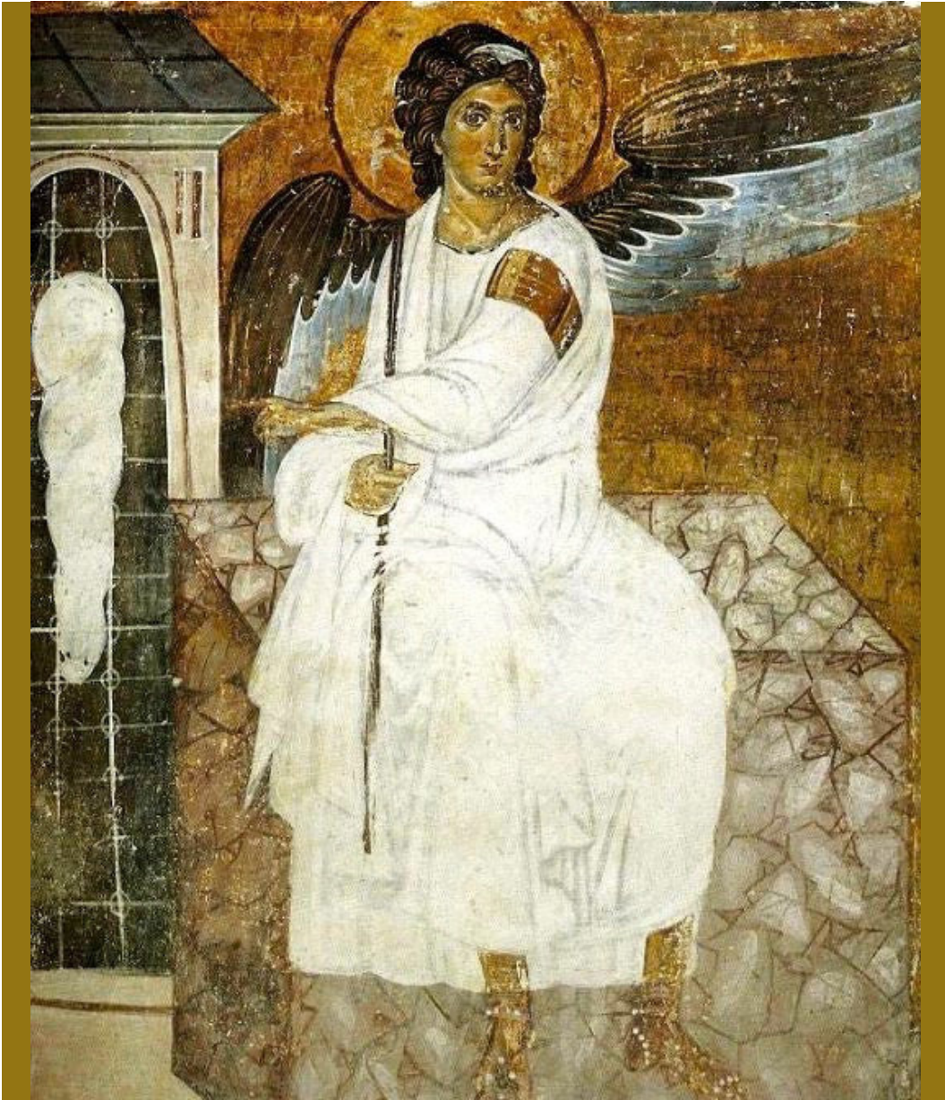
Angel of the Empty Tomb, Mileševa Monastery, 13th century fresco

RESURRECTION OF THE LORD EASTER SUNDAY MARCH 31, 2024