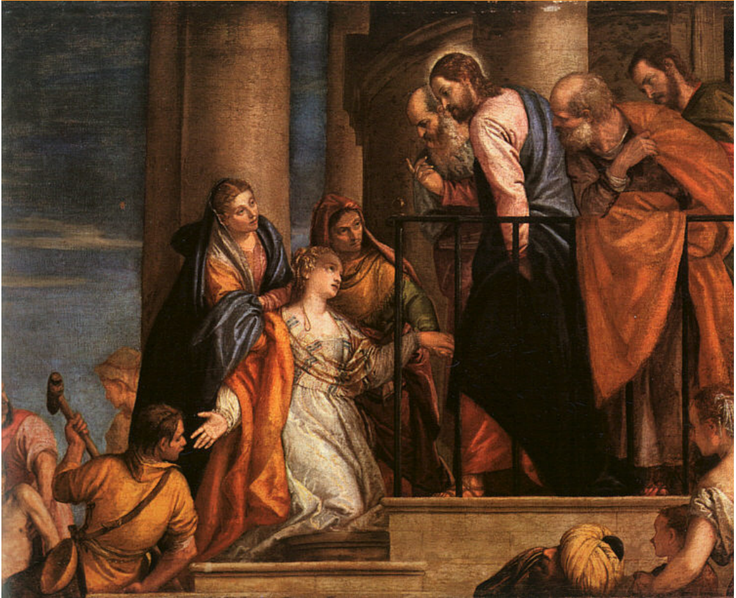
Paolo Veronese, Christ and the Hemorrhaging Woman , c. 1565

FIFTH SUNDAY IN LENT MARCH 17, 2024 • 11:00 AM