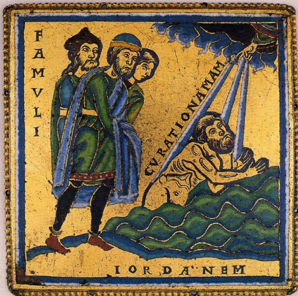
Plaque from an altar retable showing the cleansing of Naaman, made in the Meuse Valley, ca. 1150–60