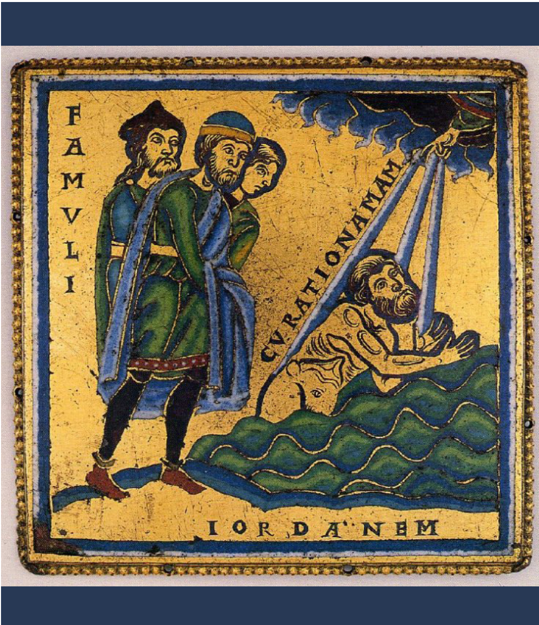
Plaque from an altar retable showing the cleansing of Naaman, made in the Meuse Valley, ca. 1150–60

FOURTH SUNDAY AFTER PENTECOST JULY 3, 2022 • 10:00 AM